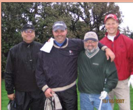
Still smiling, even in the rain!

The organization for the 11th golf tournament is well underway and will be held at Quarry Oaks sometime late 2008. We are looking forward to meeting the faithful supporters and seeing new faces.