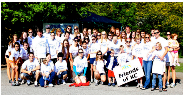
Friends of KC